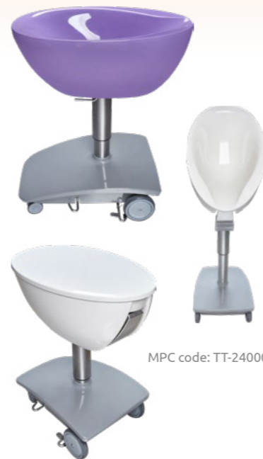
MPC code: TT-24000