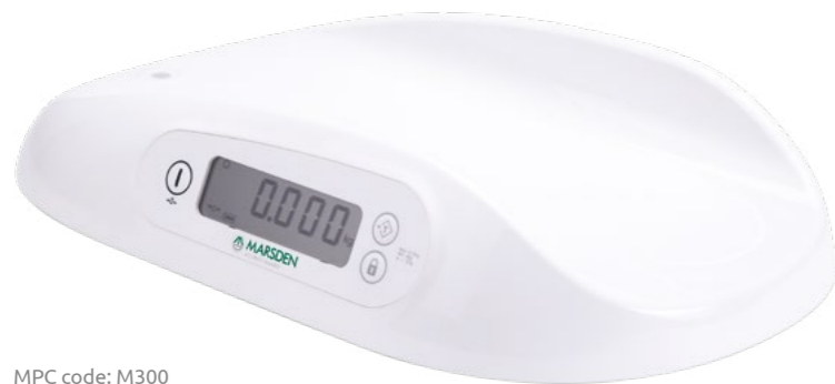
MPC code: M300

It is lightweight with tare and hold functions and runs on 2 x AA batteries to deliver over 600 hours of continuous use. An adaptor is also available if required.