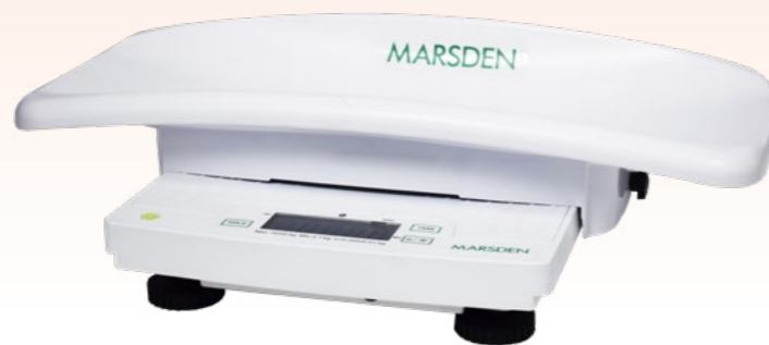
MPC code: M400

The 6 x AA batteries provide up to 6000 weigh ins with a mains power adaptor available if preferred.