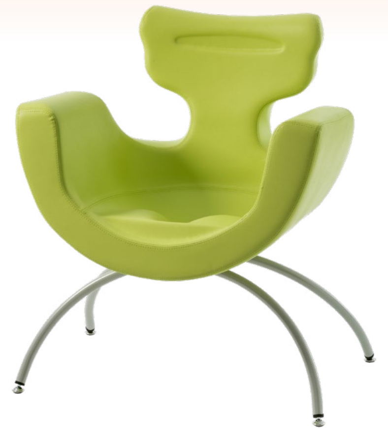
MPC code: 365900

The MimmaMà® chair also supports the simultaneous feeding of twins and avoids postural pain due to incorrect positions. The carefully considered design allows the mother to fully enjoy the relationship with her child during feeding.